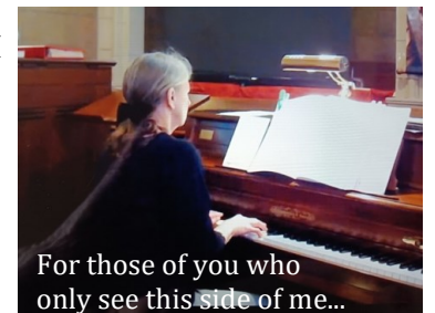
For those of you who only see this side of me...