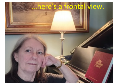
...here's a frontal view.