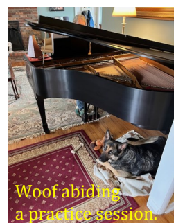
Woof abiding a practice session.